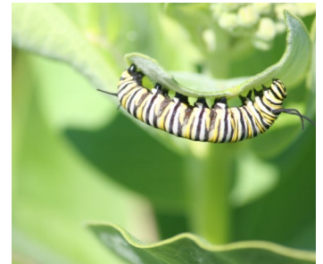
Monarch caterpillar munching on milkweed.

Welcome to MonarchNet News, an E-newsletter dedicated to monarch and butterfly citizen science projects. Do you tag monarch butterflies during migration or monitor larvae in the summer? Perhaps you are curious about how the data collected by citizen scientists like yourself are used. If so, join us to explore different butterfly citizen science projects and meet volunteers from across the country who contribute so much to their conservation! Monarch citizen science and long-term monitoring have been key to our understanding of monarch biology and conservation. Therefore, The Monarch Joint Venture wants to increase monarch monitoring efforts, and the analysis of the resulting data. The goal of this newsletter is to provide a forum for sharing outcomes from these projects and encourage more volunteers to participate in monarch citizen science. This first edition is just an introduction; we look forward to your input on the content of future issues.