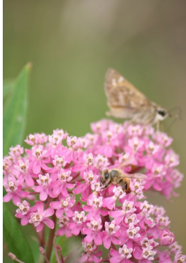
Pollinators on a swamp milkweed ( A. incarnata ). Wendy Caldwell

Four monarch monitoring projects (listed below) with a continental scale, and many regional and local programs (Fig. 1), are helping us learn about, and conserve, monarchs.