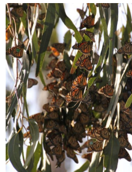
Monarchs roosting on eucalyptus, Halcyon Hills.

Help us spread the word. Send this newsletter to friends who may be interested, and encourage them to “Get Updates” under News & Events on the MJV website!